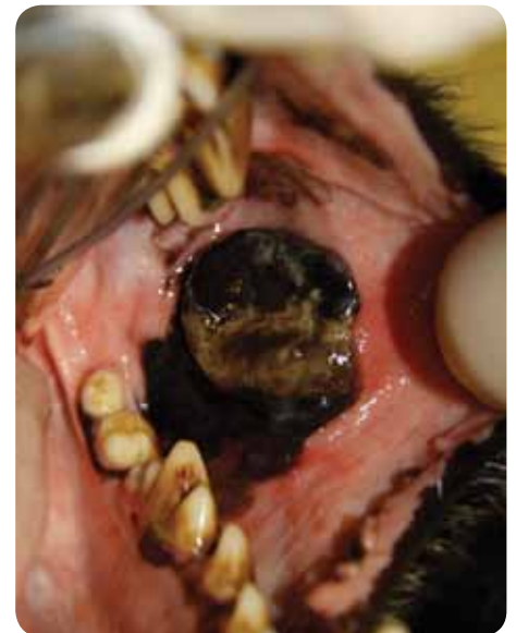
Figure 1 - Stage 2 oral melanoma in an eight year old cross bred dog. The tumour was resected and the defect repaired using two single pedicle advancement flaps (H-plasty). The ipsilateral tonsil, mandibular, parotid and medial retropharyngeal lymph nodes were also removed. There was evidence of metastasis to the tonsil but not to the local lymph nodes. This patient has started a course of the Canine Oral Melanoma Vaccine.