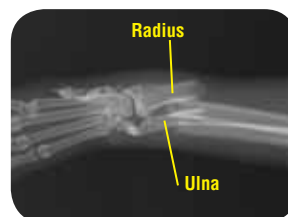
Radiograph of a dog with a fractured forelimb involving both radius and ulna bones.