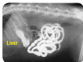
Abdominal radiograph of a cat. Barium outlines the stomach and intestines